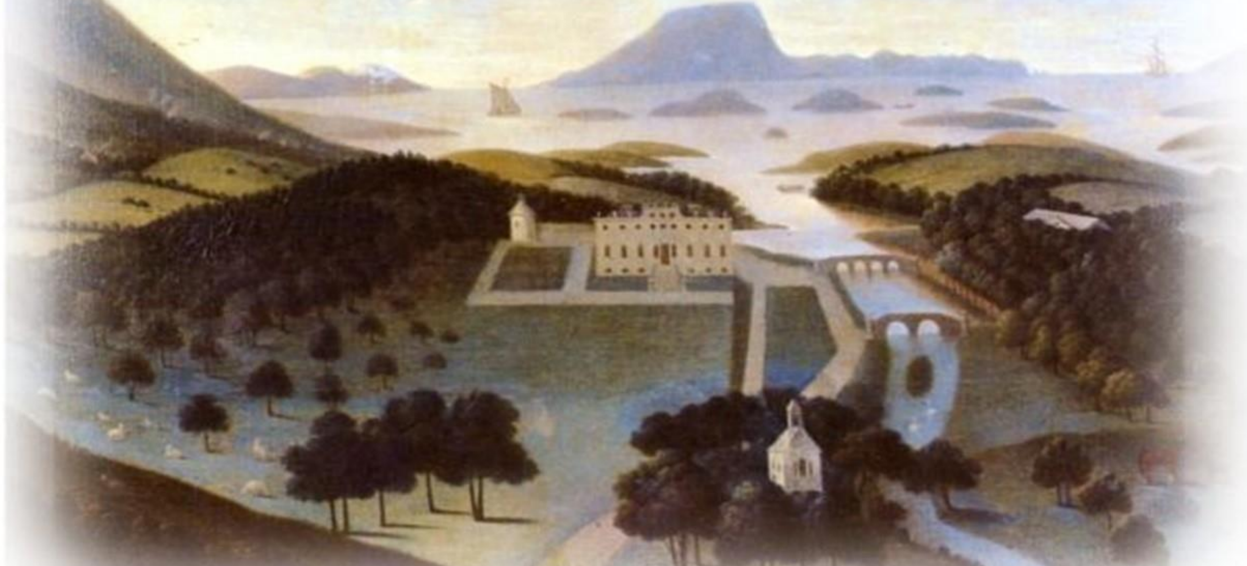
George Moore . The view up Carrowbeg River from the Quay Oil on Canvas. 1767. Collection Westport House.