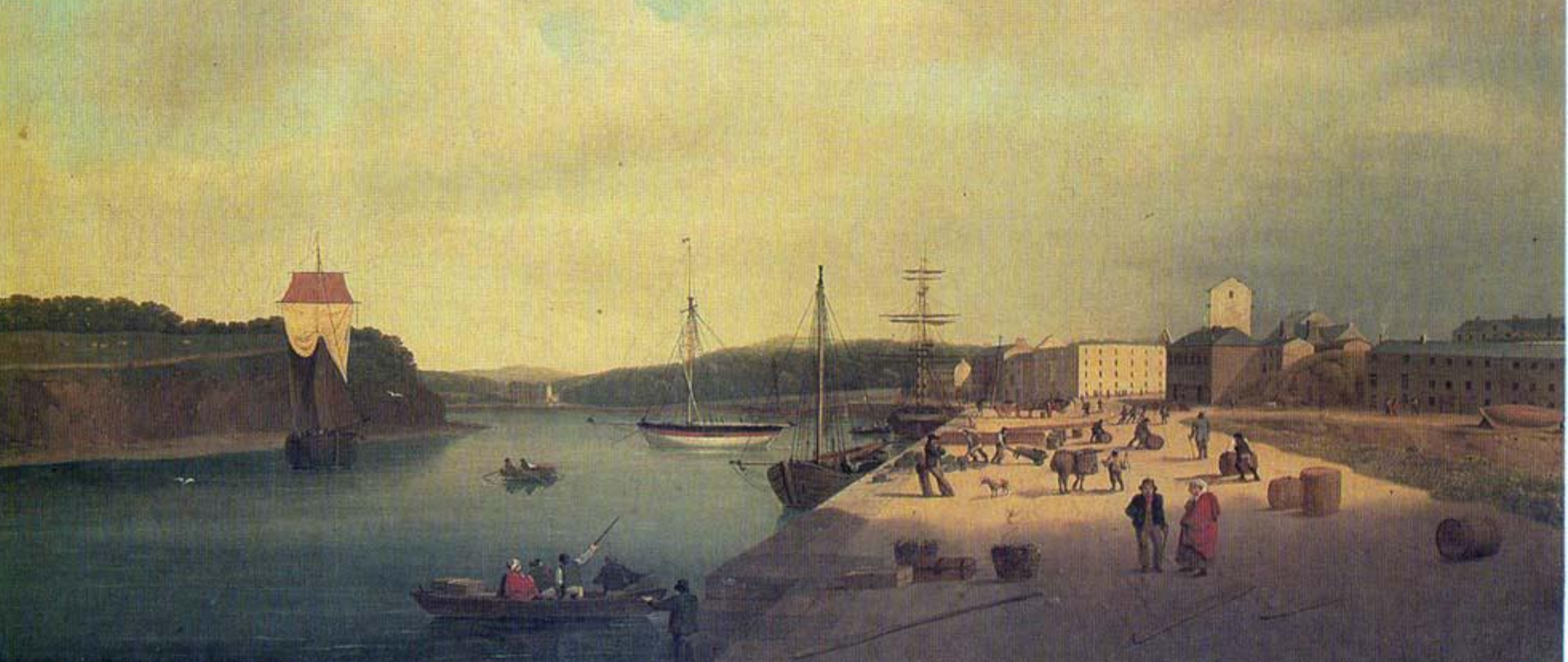
James Arthur O'Connor Westport Quays with a view of Westport House Oil on Canvas 1818 Collection Westport House

Westport is the premier tourist towns in the west of Ireland. It has the distinction of being one of Ireland's few planned towns. One of the chief architectural landmarks of Westport is Westport House, former home of Lord Sligo, Earl of Altamont. The town is situated at the entrance to Clew Bay dominated by Croagh Patrick in the background. Its location led to the development of the Quay area. Westport was Mayo's main port until the coming of the railways in the 1870s.